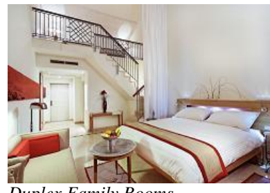
Duplex Family Rooms

Family rooms located at the Spa area with bedroom and separate living room with bunk bed for the children, sofa corner and table. No balcony