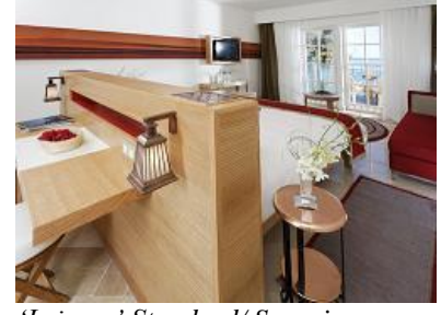
'Leisure' Standard/ Superior