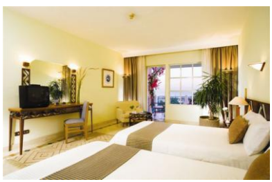
Classic / Classic Sea view